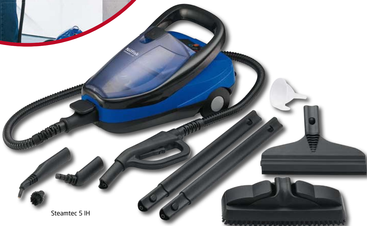
Steamtec 5 IH